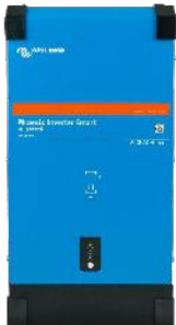
Phoenix Inverter Smart 12/3000