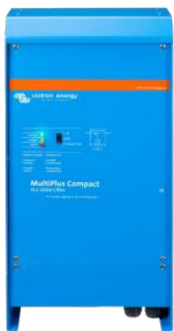
MultiPlus Compact 12/2000/80

When connected to the Ethernet, systems with a Color Control GX or other GX device can be accessed and settings can be changed remotely.