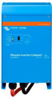
Phoenix Inverter Compact 24/1600

The possibilities of paralleled high power inverters are truly amazing. For ideas, examples and battery capacity calculations please refer to our book 'Energy Unlimited' (available free of charge from Victron Energy and downloadable from www.victronenergy.com ).