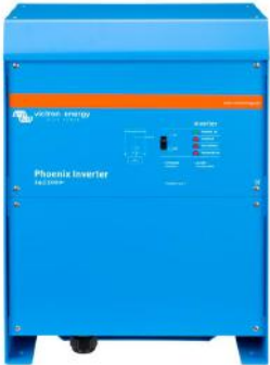
Phoenix Inverter 24/5000