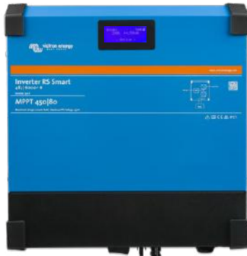
Inverter RS Smart 48/6000

Programmable Relay, temperature sensor and voltage sensor connections. The remote input can also be configured to accept the Victron smallBMS.