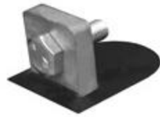
LT - Lug Terminal